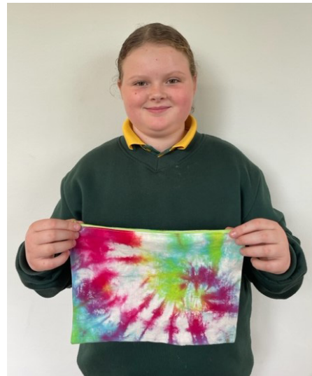
YEAR 8 SLIPPER SOCKS