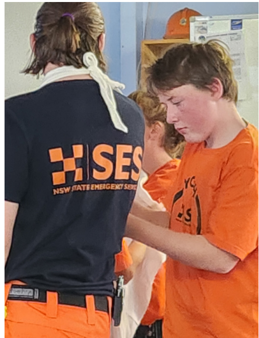
YR 7 ZIPPERED POUCH